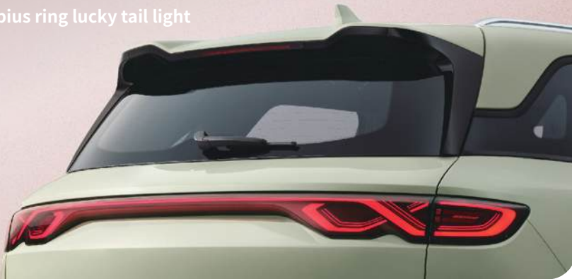
Mobius ring lucky tail light